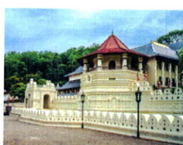
SRI DALADA MALIGAWA KANDY