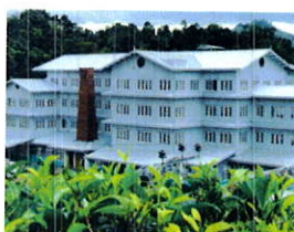
TEA FACTORY GERAGAMA