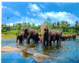
PINNAWALA ELEPHANT ORPHANAGE